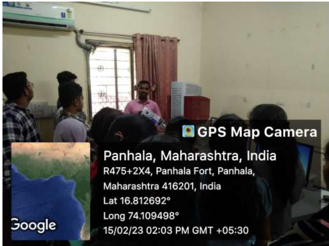
Students getting information about FE-SEM at Department of Physics