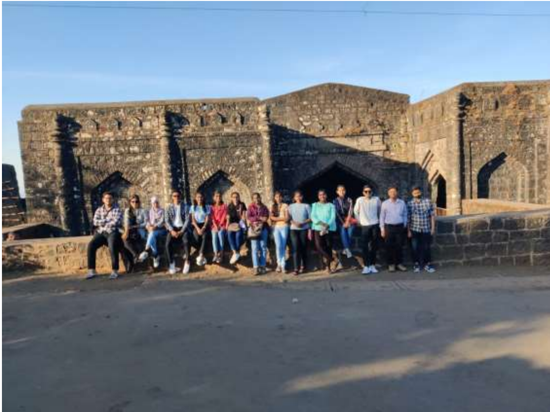
At Panhala Fort, Ambarkhana