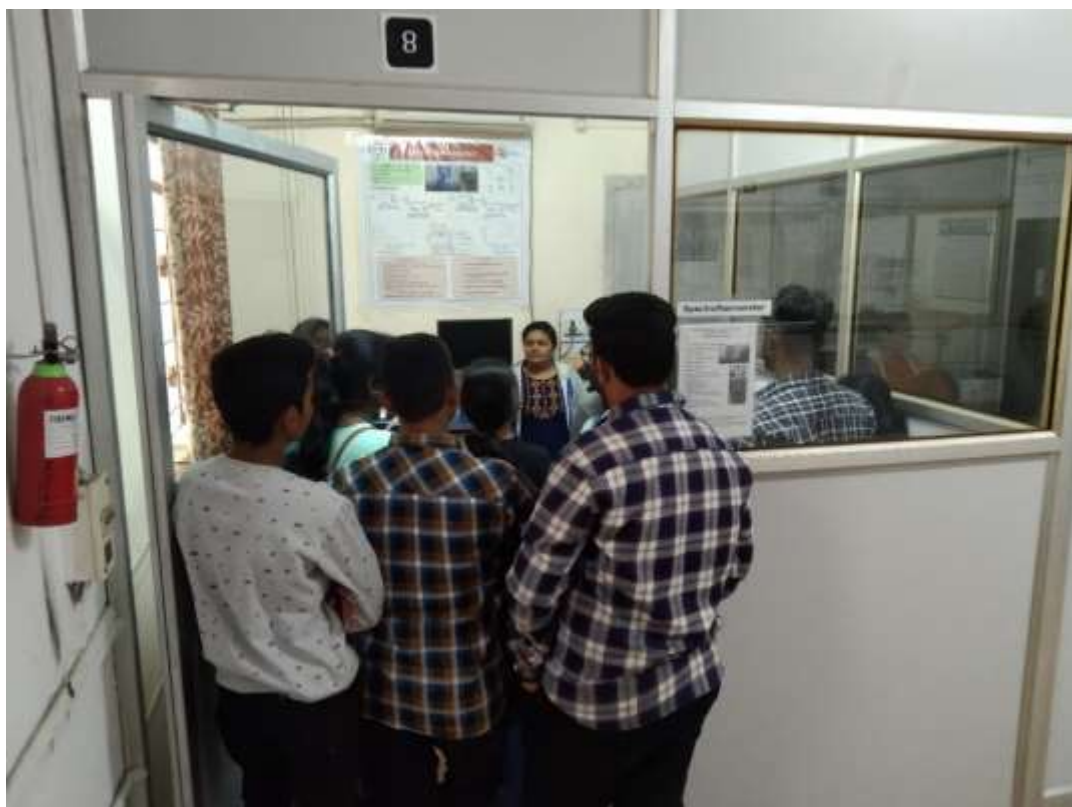
Students getting information about Spectrofluorometer at Department of Physics