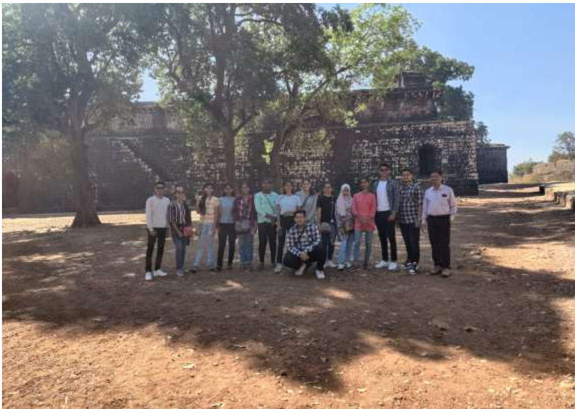
At Panhala Fort