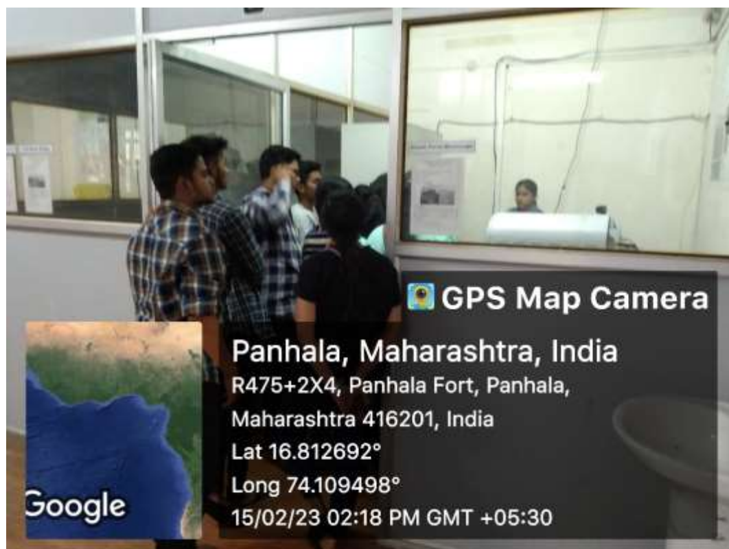
Students getting information about AFM at Department of Physics