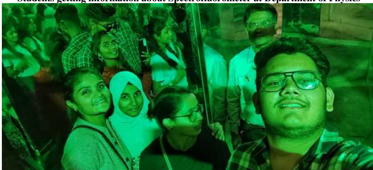
Mirror house at Sidhhagiri math, Kaneri